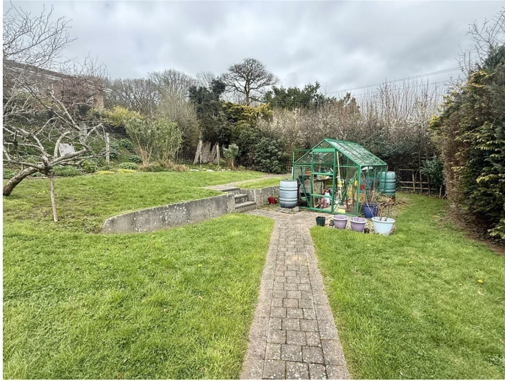
Greenhouse with electric point.